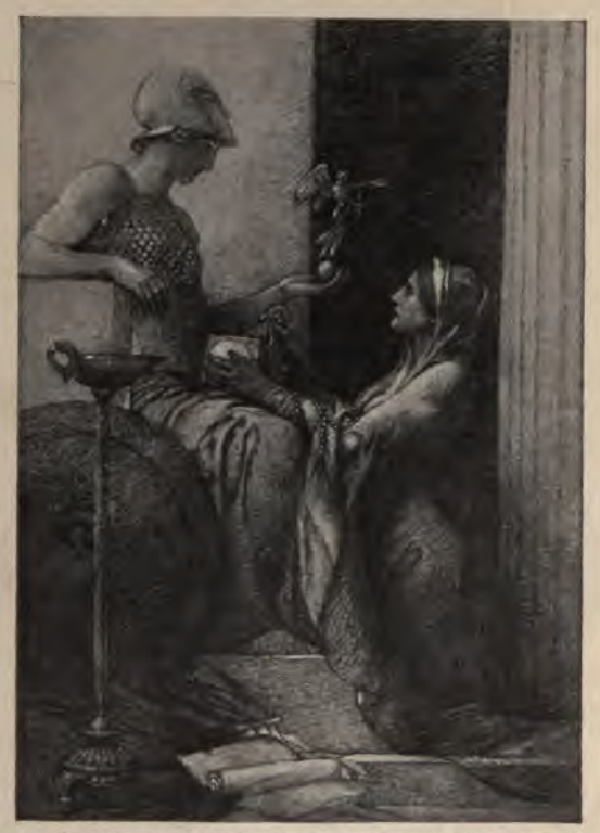
STANFORD VNIVERSITY LIBRARY